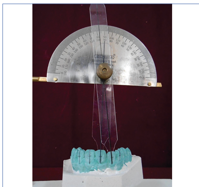
[Table/Fig-4]: Mesiodistal angulation measured on the mounted maxillary cast by the pointers on the jig.

horizontal arm of the jig was so adjusted that, the labial surface of the maxillary central incisor was in front of the fixed pointer A and the maxillary lateral incisor was in front of the movable pointer B. Then, the middle long axis, marked by lead pencil, on the labial surface of maxillary central incisor was coincided with the pointer A and that of the maxillary lateral incisor was coincided with the pointer B above the platform. The reading was noted on the graduated metal scale of the protractor, where the other end of pointer B extended [Table/Fig-4].