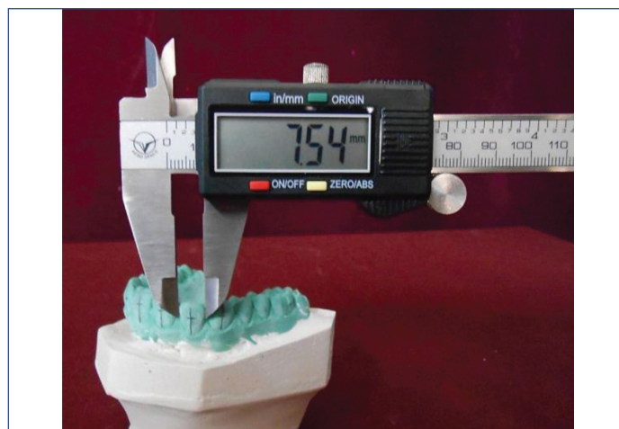
[Table/Fig-3]: Mesiodistal width of maxillary lateral incisor measured using digital vernier calliper.

The mounted maxillary cast was then mounted on the Perspex platform of the custom-made jig [Table/Fig-2]. The height of the